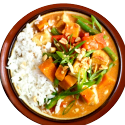
SF06 Massaman Curry

WARNING! PLEASE LET US KNOW IF YOU HAVE ANY FOOD ALLERGIES.