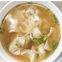
S01 Wonton Soup