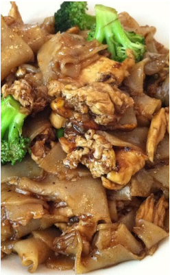
T02 Pad See U

Athens Wok 493 E Clayton St Athens, GA 30601 (706) 850-2695