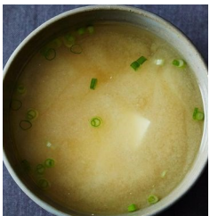
S08 Miso Soup