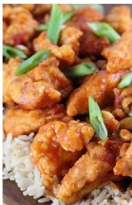
C18 Hunan Chicken