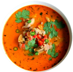
SF06 Red Curry