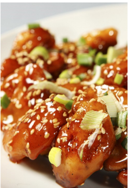
C16 Sesame Chicken