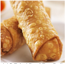
A13 Fried Beef Egg Roll

Athens Wok 493 E Clayton St Athens, GA 30601 (706) 850-2695