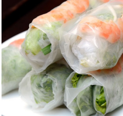
A15 Fresh Shrimp Basil Roll