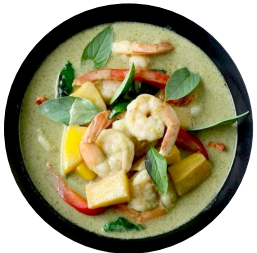
SF06 Green Curry