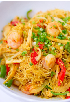
T13 Singapore Noodle